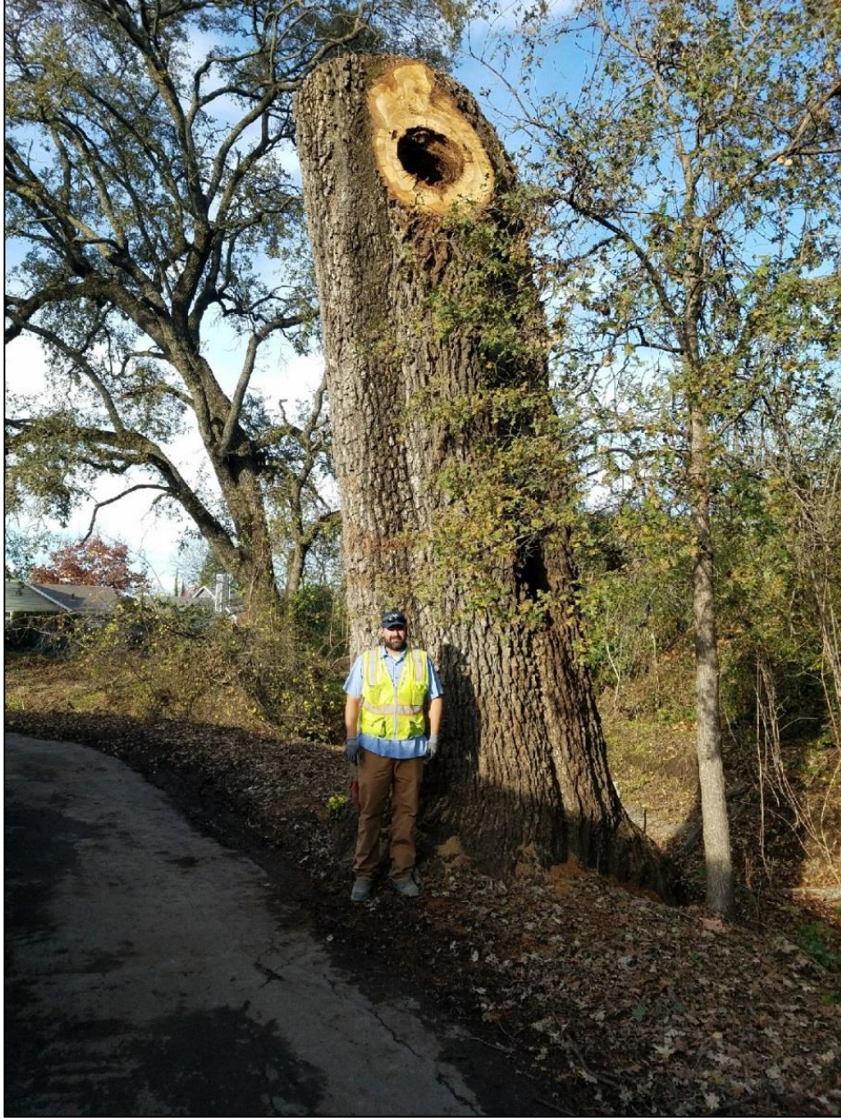
Picture of the tree trunk to show scale