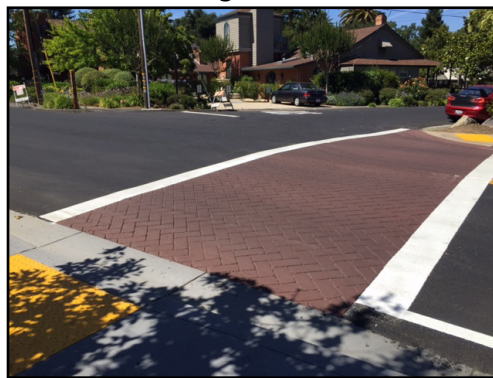
New ADA crosswalks at Washington and Webber

Residents can now walk from the south end of town to the north end on ADA accessible pathways and crosswalks along Yount Street and Washington Street.