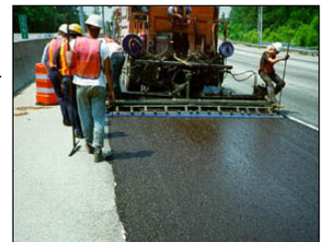
An example of microsurfacing

See Your Measure A Funds at Work! On July 6, 2015 The Town will begin the Hopper Creek Flood Control Improvement Project. Areas impacted include: Washington Street by The French Laundry Gardens, behind the Villagio Inn, Finnell to Beard Ditch and Oak Circle at Hopper Creek.