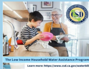
The Low Income Household Water Assistance Program Learn more: https://www.csd.ca.gov/waterbill

California Department of Community Services & Development